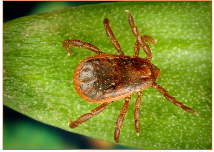
Brown dog tick ( Rhipicephalus sanguineus ) that transmits Ehrlichia canis

Yes, various Ehrlichia spp. can cause human disease. These infections are most frequently the result of tick bites. Pets are not considered a direct source of infection to people; however, pets can bring ticks into contact with people and tick control on pets helps to reduce human disease risk. People are not believed to be infected with E. canis .